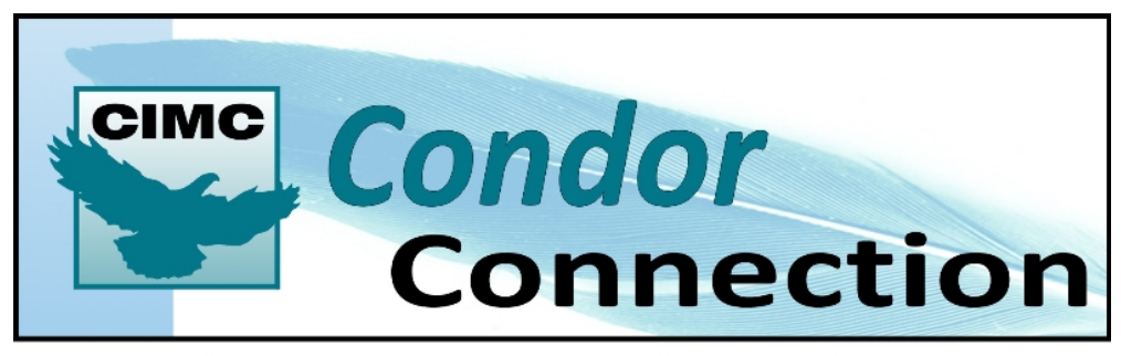
The CIMC Movement: Creating Positive Change for Native Communities